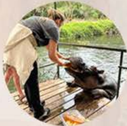
Visit to Jessica the hippopotamus.