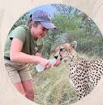
Daytime safaris and nighttime safaris.