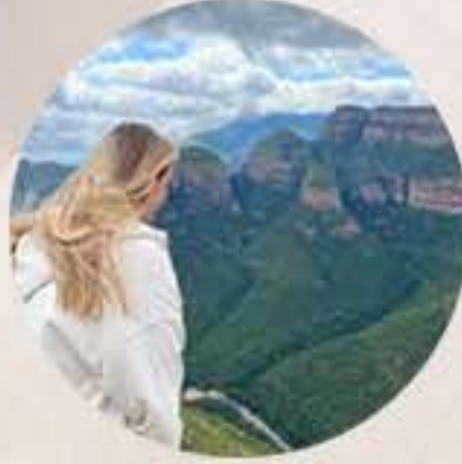
A visit to Kruger National Park.