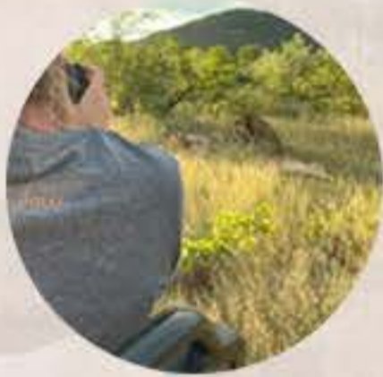
Safari through 'The Big Five' area.