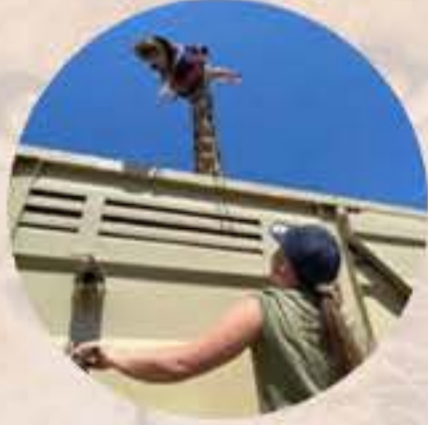
Practical exercises with darts.