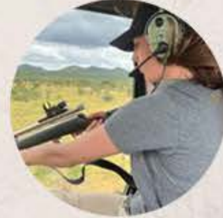
Dart darting from a helicopter.