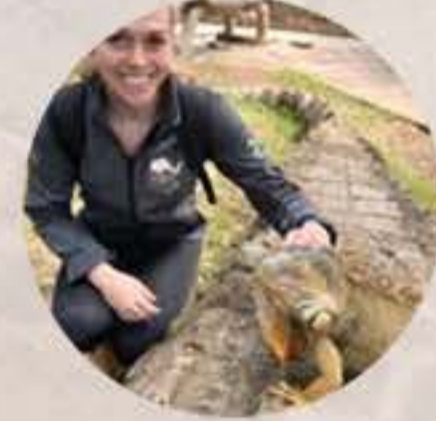
Visit to the Kinyonga Reptile Center.