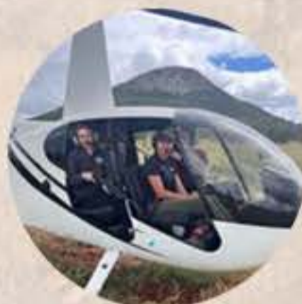
Panoramic route excursion.