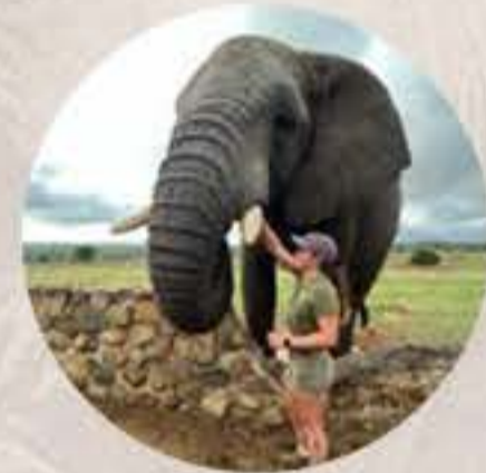
Interaction with the African elephant.