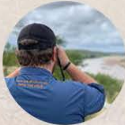
Visit to the Moholoholo Rehabilitation Center.